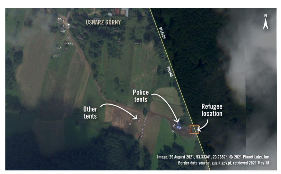
Poland-Belarus Border. 29 August 2021. Planet Labs.