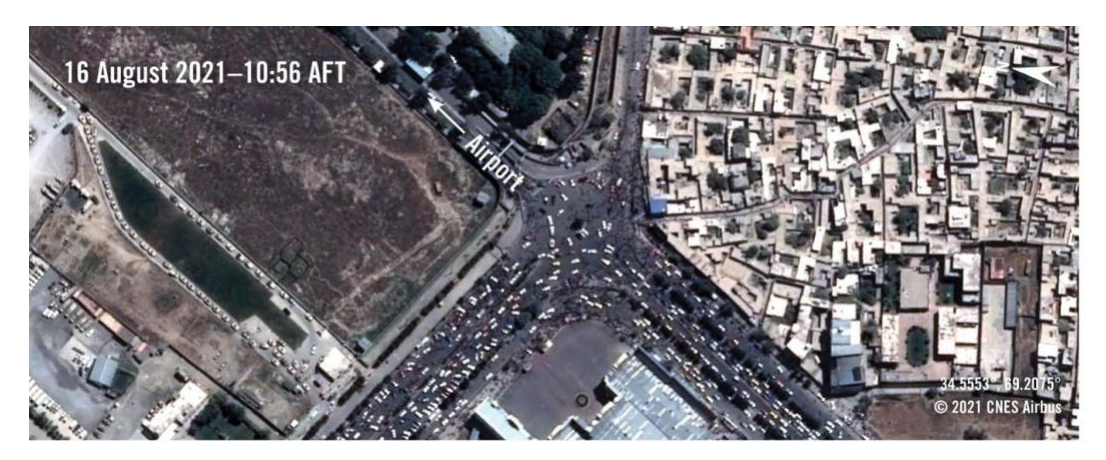
Kabul Airport vicinity. 16 August 2021.

In this report, Amnesty International, International Federation for Human Rights (FIDH) and the World Organisation against Torture (OMCT) have documented incidents of human rights violations that have taken place in Afghanistan since the takeover by the Taliban on 15 August. This report calls on the UN Human Rights Council (UNHRC) to take decisive action to establish a robust independent investigative mechanism to monitor and report on human rights abuses committed in violation of international human rights law, and to contribute to accountability for crimes under international law. Human rights defenders, journalists, and others who are targeted for their work must be evacuated and given safe passage if they wish to leave Afghanistan; and women and girls, and ethnic and religious minorities who are targeted because of their gender, ethnic, and religious identity, must be guaranteed protection. All those who wish to leave Afghanistan must be assured the right to seek asylum. At the same time, the Office of the Prosecutor of the International Criminal Court must receive assistance from the international community to immediately recommence its investigations into crimes under international law committed in Afghanistan.