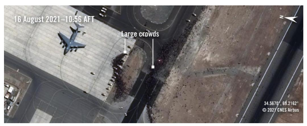
16 August 2021. Kabul Airport.

The thousands who are left behind, or are trying to leave Afghanistan, are testament to the brutal regime of the Taliban circa 2001, when extrajudicial executions abounded, and women and girls were oppressed with a plethora of restrictions. Since then, even in the last 20 years, the Taliban and other armed groups have conducted brutal attacks on civilians, journalists, human rights defenders, and government workers, resulting in Afghanistan having one of the highest civilian deaths in the world. Nearly 50,000 civilians have died in the last 20 years. The first half of 2021 alone recorded 5183 civilian casualties (1,659 deaths and 3,524 injuries), of which 32 per cent were children. This is a 47 per cent increase in civilian casualties compared to the same period in 2020. Those responsible for these casualties include both anti-government and pro-government forces.