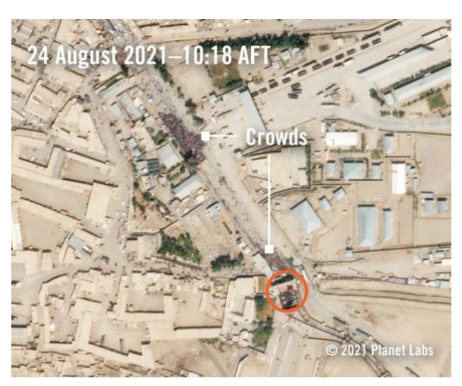
Spin Boldak-Chaman crossing. 24 August 2021. Planet Labs.

Spin Boldak border crossing. 2 August 2021. Planet Labs.