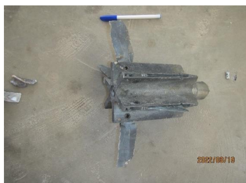
Remnant of the 120mm tank round that hit the home of the al-Amour family at about 3.55pm on 5 August 2022

Duniana was pronounced dead shortly after she reached the hospital, while her mother, Farha, who was also taken to hospital, and her sister Areej were released on the same day, having sustained light injuries from shrapnel.