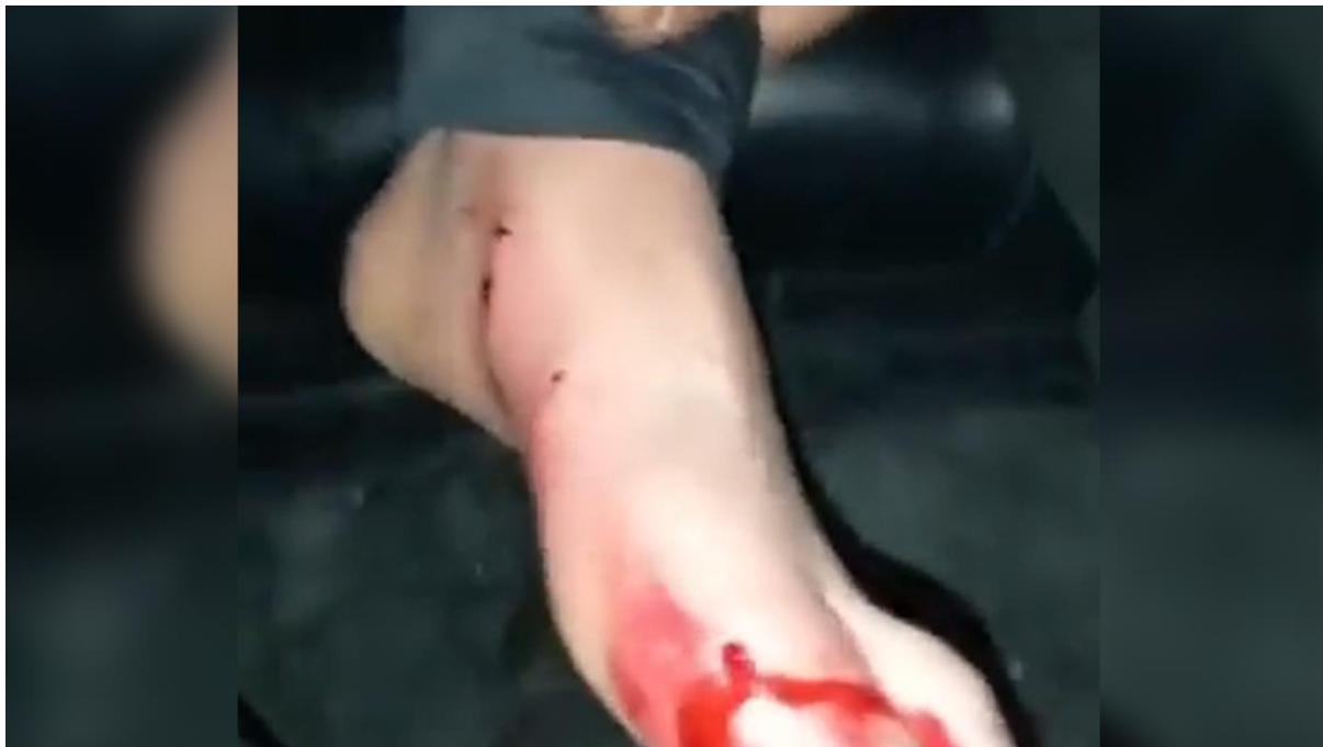
Screenshot taken from a video circulated online on 16 May 2022, showing the injuries sustained by a child during the crackdown of protests in Chaharmahal and Bakhtiari province.

“This is the work of the police [officials from the Law Enforcement Command of the Islamic Republic of Iran (known by its Persian acronym Faraja )] and the Basij [a paramilitary volunteer militia operating under the Islamic Revolutionary Guards Corps] in Chaharmahal and Bakhtiari. They did not even show mercy to a seven [or] eight-year-old-child.”