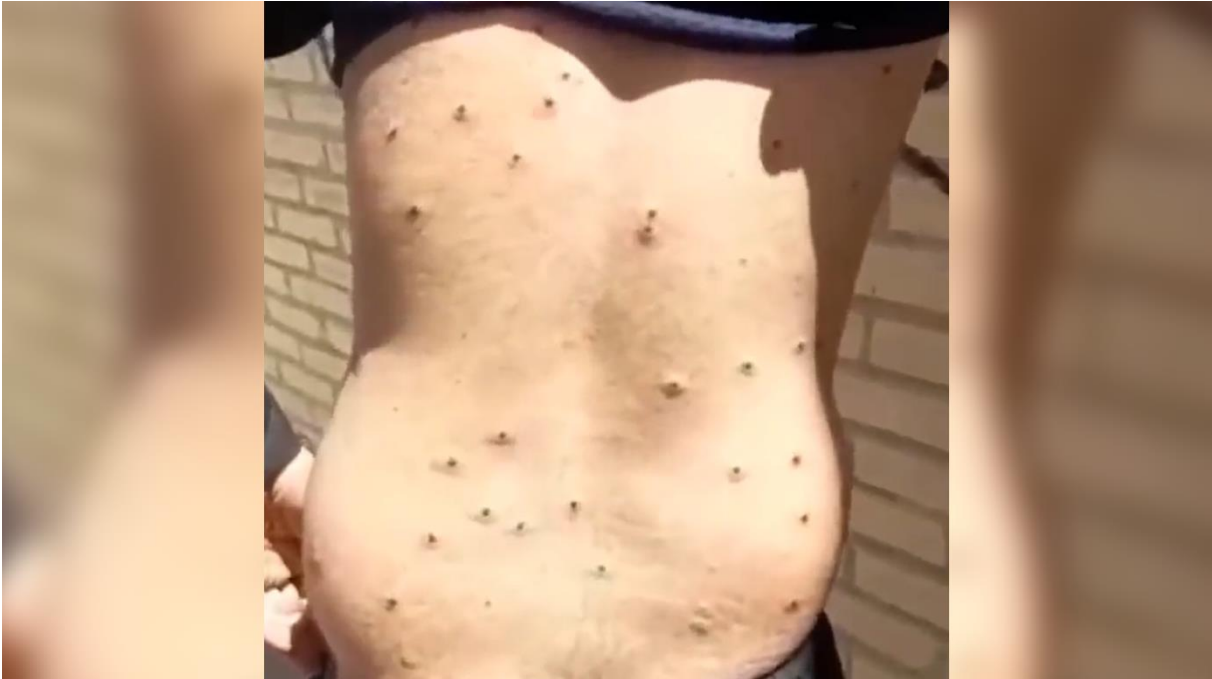
Screenshot taken from a video circulated online on 15 May 2022, showing the birdshot injuries sustained by a protester in Chelicheh. The video also shows injuries to his lower back and buttocks.