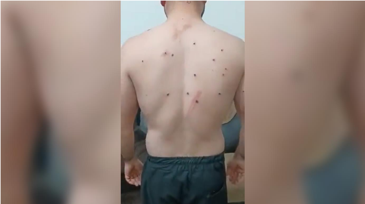
Screenshot taken from a video circulated online on 15 May 2022, showing the birdshot injuries sustained by a protester in Shahrekord. The video also shows injuries to his head.

Two videos, which circulated online on 15 May 2022 and which the persons filming say were from Shahrekord and Chelicheh, show classic spray patterns of birdshot wounds to the backs, buttocks and/or heads of those injured. 33