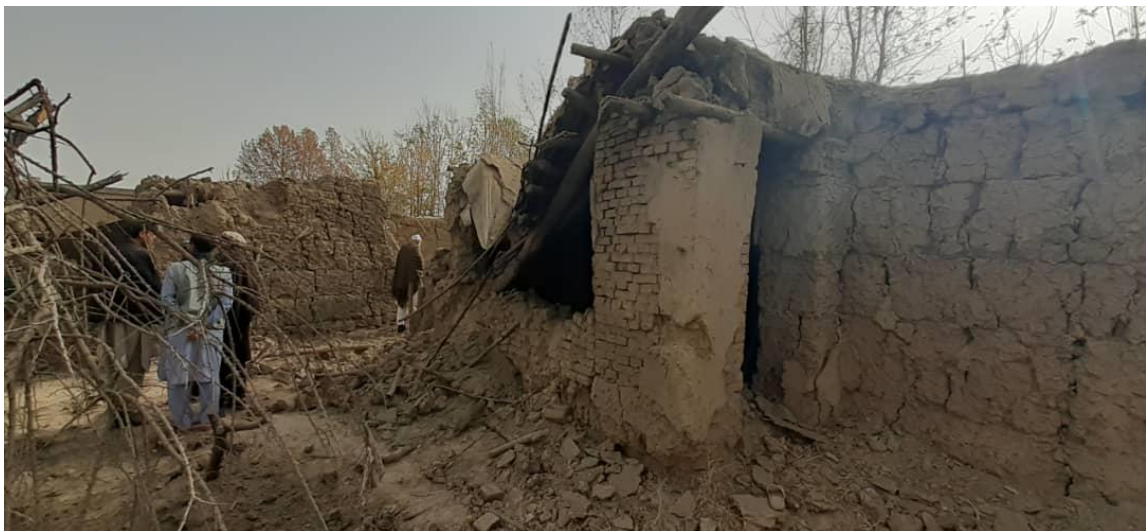
The home destroyed by the first air strike, looking southwest.

Just after midnight, a witness who was in the home heard planes begin to circle overhead. 138 About 20 minutes later, the first bomb struck the family compound. The aircraft continued to circle, and the second air strike impacted 15 minutes later.