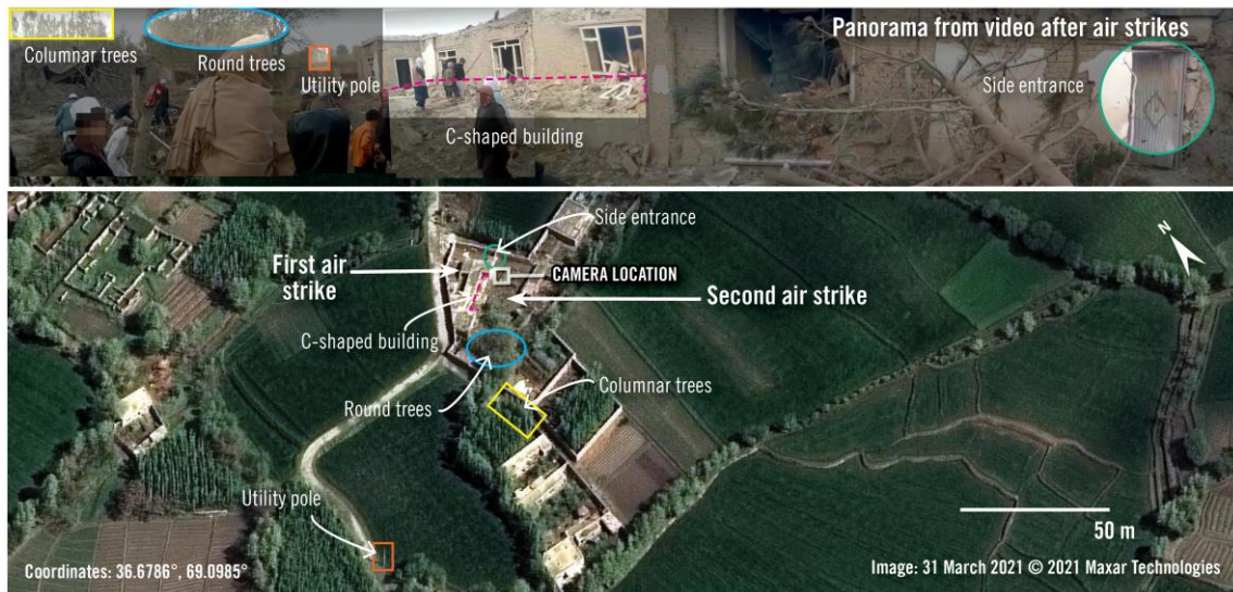
A panorama of a video acquired by Amnesty International shows damage from two air strikes on a compound in Kunduz Province, Afghanistan. The panorama highlights features from the video, that were aligned with the satellite imagery.

precisely geolocate the home, and satellite imagery corroborates that the compound was struck between 7 and 16 November 2021.