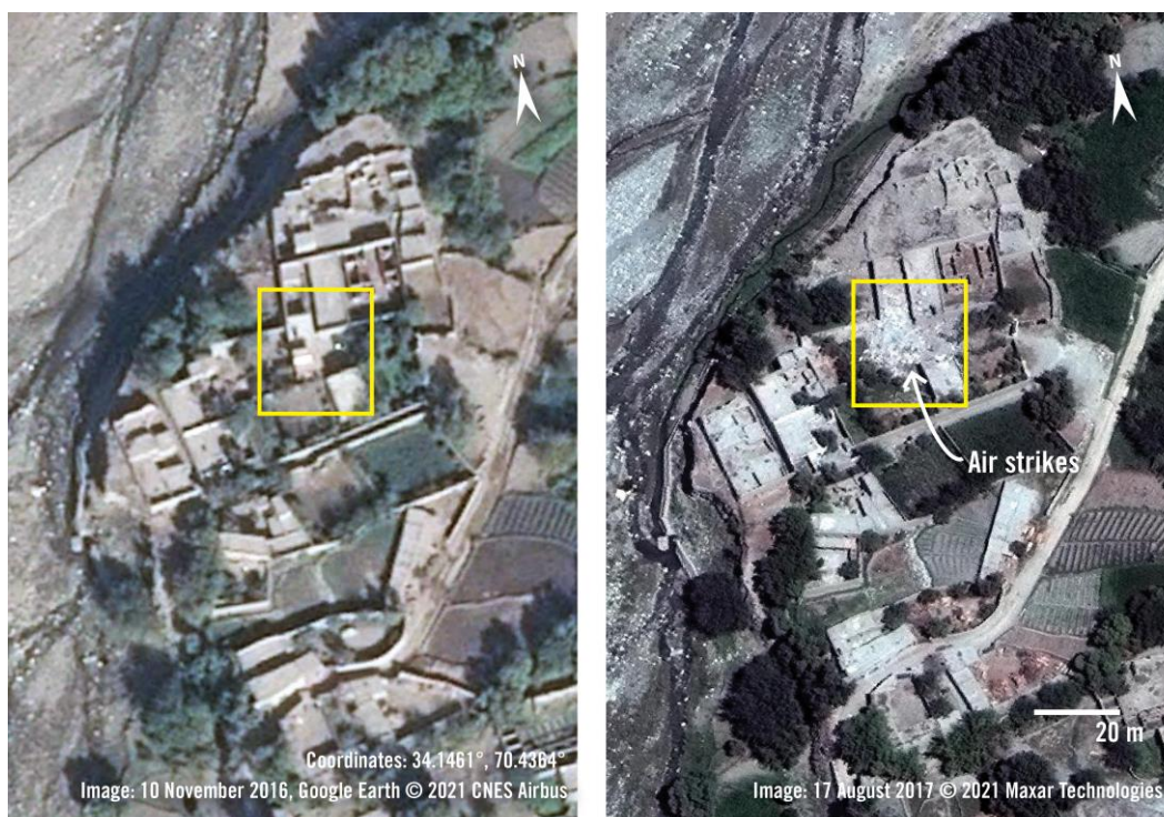
High resolution satellite imagery from 17 August 2017 shows the site of two air strikes in Nangarhar Province, Afghanistan. Low resolution satellite imagery (not shown) was used to confirm the air strikes occurred between 22-25 July 2021.

Lower resolution satellite imagery of the area indicates that the home was struck between 22 and 25 July 2017. High resolution imagery confirms a large crater and significant damage to a home on the north side of the compound, with additional damage to a structure on the southern side of the courtyard.