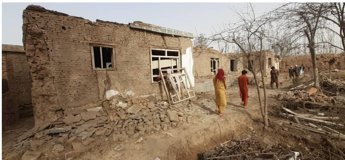
The same home, looking to the northwest.

At the time of the attack, a total of 27 people were sleeping in the compound, 25 from the family who lived there, and two guests visiting from out of town. The first weapon hit the guesthouse, along the outer wall of the compound. The blast killed Mohammad Bashir, a 23-year-old engineer, and Hajra bint Abdul Ghayyur, his 3-month-old niece. After the detonation, people inside the guest house fled out into the courtyard, and met other family members who were sleeping in the main quarters, a long low building consisting of a series of rooms and exterior patio. These civilians took refuge in two small buildings along the compound wall, one that kept goats and other livestock, and another that contained a furnace and wood for heating. “I told the women and children to go to other places, to spread out” said one man, a witness. 139 “We expected another bomb, because whenever people gather after one bomb they get hit again. The Americans do it.” 140 The second air strike hit the livestock shelter, killing three and wounding another six.