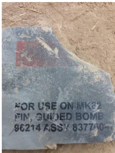
The front wing of a GBU-12 500lb Paveway II laser guided bomb that was discovered in the wreckage of the home.

Another photograph provided by the witnesses shows scrap recovered at the scene, including the front wing of a GBU-12 500 pound Paveway II laser guided bomb, with a Commercial and Government Entity (CAGE) code of 96214, indicating that it was manufactured by Raytheon. 148