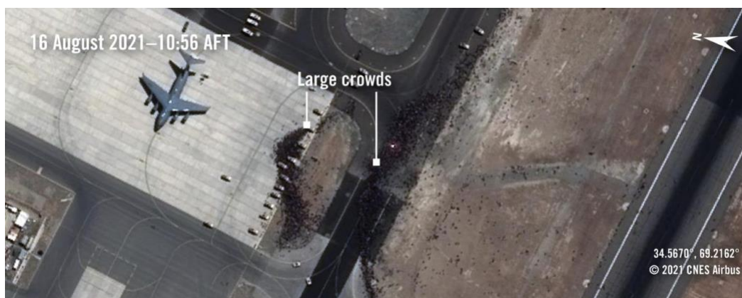
16 August 2021. Kabul Airport.

The thousands who are left behind, or are trying to leave Afghanistan, are testament to the brutal regime of the Taliban circa 2001, when extrajudicial executions abounded, and women and girls were oppressed with a plethora of restrictions. Since then, even in the last 20 years, the Taliban and other armed groups have conducted brutal attacks on civilians, journalists, human rights defenders, and government workers, resulting in Afghanistan having one of the highest civilian deaths in the world. 32 Nearly 50,000 civilians have died in the last 20 years. 33 The first half of 2021 alone recorded 5183 civilian casualties (1,659 deaths and 3,524 injuries), of which 32 per cent were children. This is a 47 per cent increase in civilian casualties compared to the same period in 2020. 34 Those responsible for these casualties include both anti-government and pro-government forces. 35