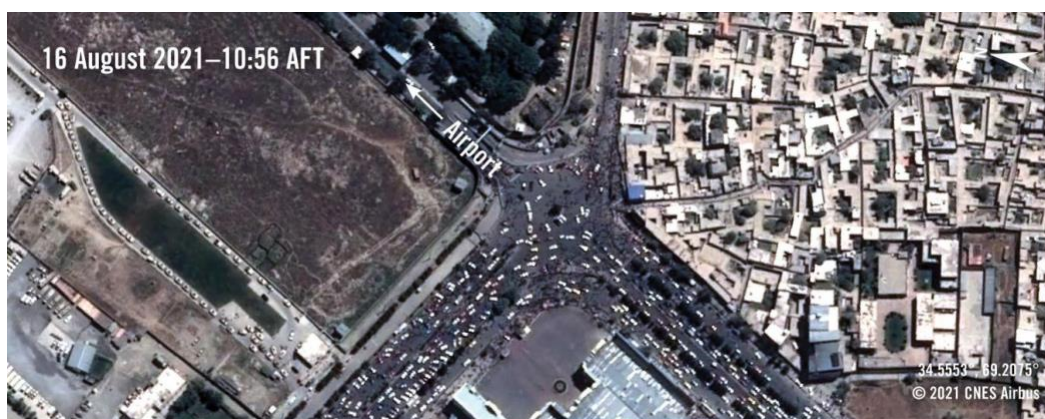
Kabul Airport vicinity. 16 August 2021.

In this report, Amnesty International, International Federation for Human Rights (FIDH) and the World Organisation against Torture (OMCT) have documented incidents of human rights violations that have taken place in Afghanistan since the takeover by the Taliban on 15 August. This report calls on the UN Human Rights Council (UNHRC) to take decisive action to establish a robust independent investigative mechanism to monitor and report on human rights abuses committed in violation of international human rights law, and to contribute to accountability for crimes under international law. Human rights defenders, journalists, and others who are targeted for their work must be evacuated and given safe passage if they wish to leave Afghanistan; and women and girls, and ethnic and religious minorities who are targeted because of their gender, ethnic, and religious identity, must be guaranteed protection. All those who wish to leave Afghanistan must be assured the right to seek asylum. At the same time, the Office of the Prosecutor of the International Criminal Court must receive assistance from the international community to immediately recommence its investigations into crimes under international law committed in Afghanistan.