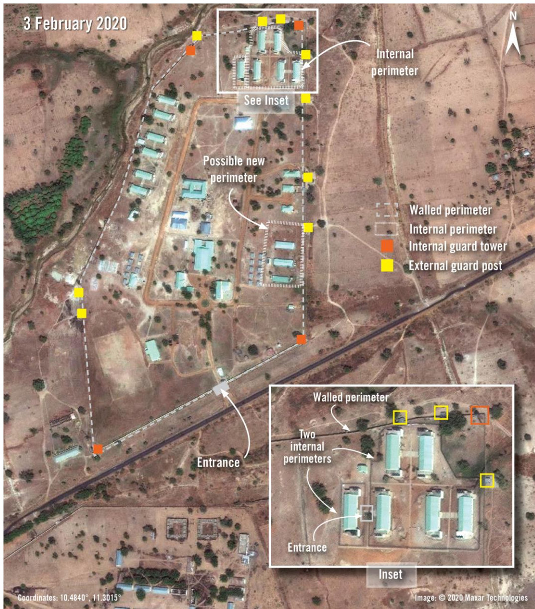
This area is located approximately 33 kilometers north of Gombe town. The entire facility is surrounded by a walled perimeter with one controlled entrance on the south side, next to the main road. There are nine structures along the walls outside the facility which could be guard posts, though the locations of the structures are somewhat erratic. There are also four probable guard towers inside the perimeter, at each corner. There are five buildings in the northeast corner that have a secondary perimeter. There is also a sixth building with a separate perimeter. The secondary perimeter and cluster of guard posts suggest it could be a detention area.

A person with direct knowledge said that with the current batch of more than 600 people, prison officials may now sometimes accompany detainees, rather than army intelligence. But the person said all movements still seem to be accompanied by a guard and that the environment is “highly regimented”. 321