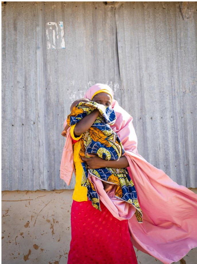
A 17-year-old girl abducted by Boko Haram and held captive for two years holds her young child, after having escaped. She is displaced to an IDP camp in Borno State, Nigeria, 2019.

Punishments also seem particularly severe or frequent for abducted Christian girls. An 18-year-old woman who was abducted at age 12 or 13 and held for four years recalled: “They forced us to learn the Qur’an and would lash whoever was not paying attention or not able to recite their verses... As a Christian, it meant they lashed me every day, because I could not learn. They’d lash me... and call me an infidel.” 86 The woman had a son from her forced marriage and said her “husband” was killed two years into her captivity. “They said after my first menstruation [after the son’s birth], I’d have to remarry,” she recalled. “They kept coming to ask if I’d started menstruation and I said no.” 87 She later escaped with another woman.