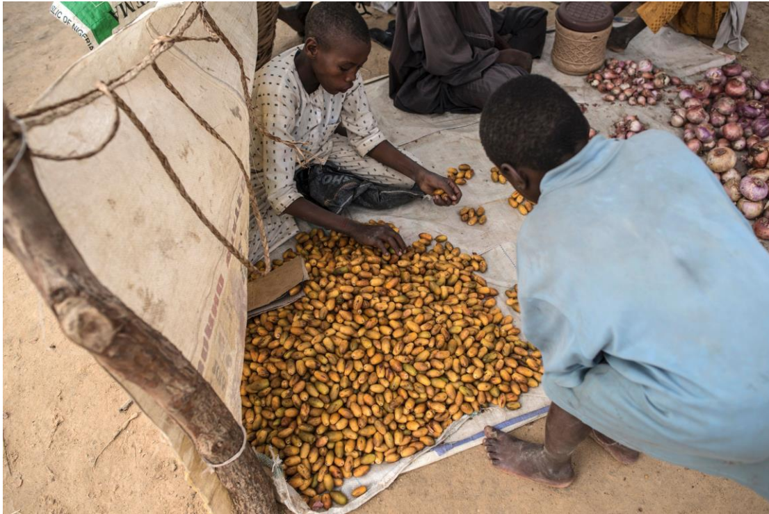
Boys sort through fruit at a vendor in the Bakasi IDP Camp on 6 July 2017, Maiduguri, Borno State.