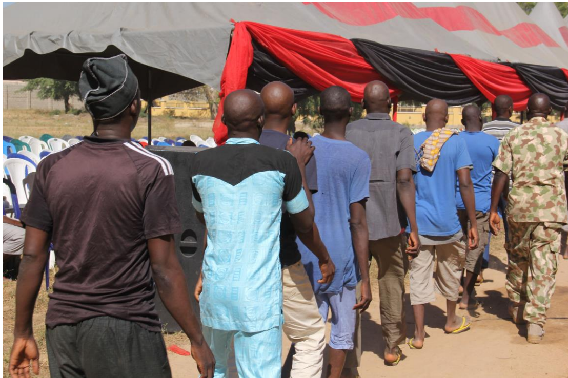
Men and boys released from Giwa Barracks after months or years of unlawful detention walk in a line as they are handed over to state officials in charge of a "transit centre" where they will be held before returning to their communities, 27 November 2019, Maiduguri, Borno State.