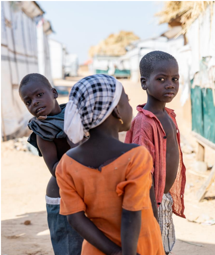
Displaced children unable to access education in Dalori 1 Camp outside Maiduguri, Borno State.

To date, the Nigerian government has fallen well short of that obligation. Instead, as subsequent chapters detail, the military has detained thousands of boys and girls coming out of Boko Haram territory for months and even years; subjected the vast majority of those in detention to torture or other ill-treatment; reached few children with psychosocial support; impeded humanitarian assistance and otherwise failed to respect many displaced children’s rights to food and to physical and mental health, exacerbating underlying distress; and failed to ensure children have access to education.