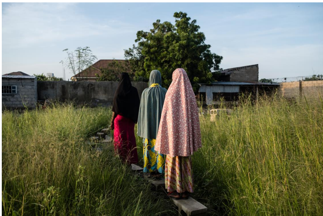
Three women and girls walk home in Maiduguri, Nigeria, on 4 September 2019. One woman had been abducted by Boko Haram as a girl and then detained in Giwa Barracks for 15 months after escaping. Another spent two years in Giwa.