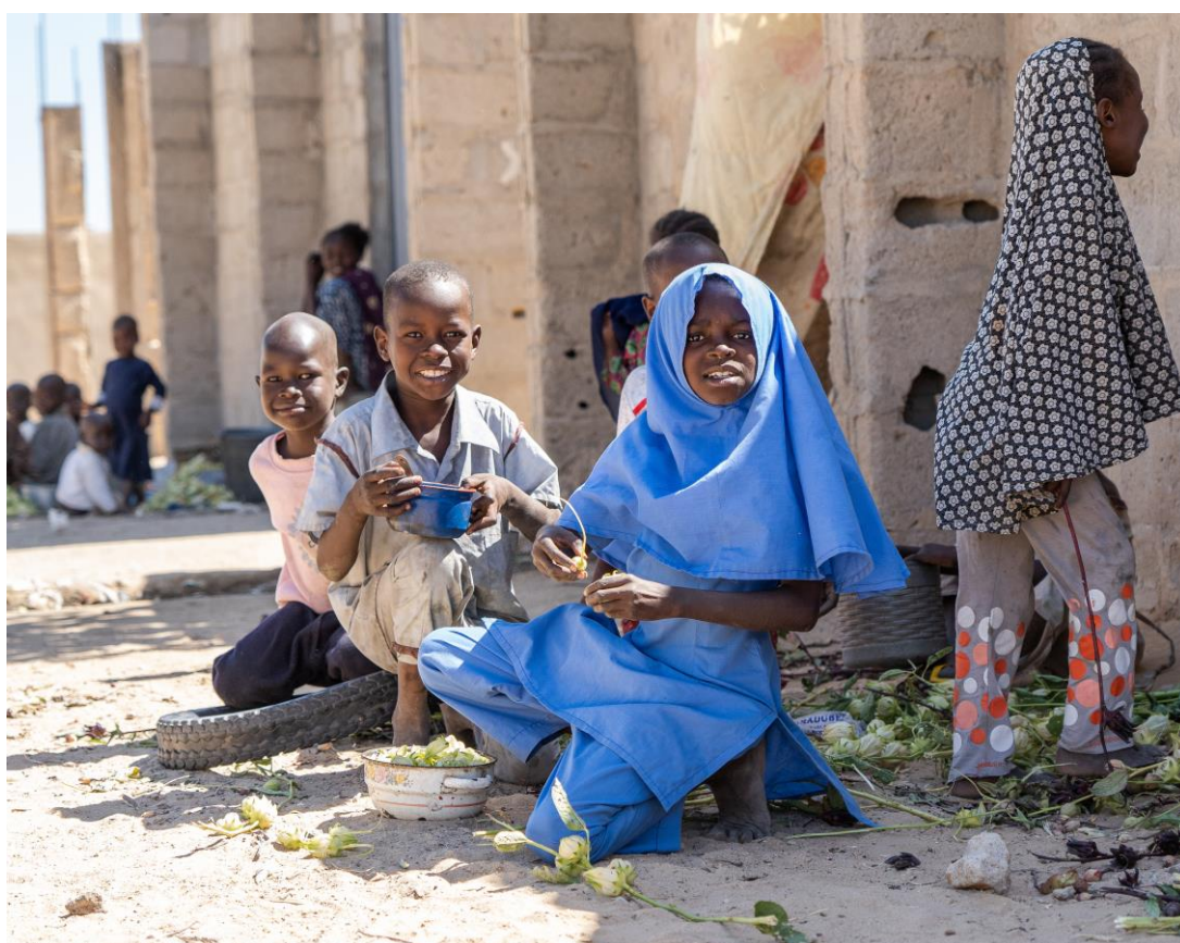
After finishing class in primary school, a girl (in blue uniform) plays with other children who are not in school, before going home, Kaleri, Borno State, Nigeria, 2019. The area, located near Jere, has been attacked several times by Boko Haram.