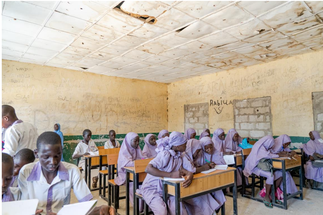
Children sit at their desks in Kaleri primary school, located in the host community, Borno State, 2019. The area has been attacked by Boko Haram several times.

Some parents and other guardians told Amnesty International they had pulled children out of school after hearing how they spent their time; some parents and community leaders had gone to see classes for themselves, before removing children. The father of a 10-year-old girl in Monguno's Water Board Camp said he registered his daughter for the school in town for displaced children and ensured she went every day, even providing money from the family's food distribution for the girl to take a keke tricycle taxi. However, the girl consistently returned and "told me they don't teach them anything in school, that they only go there to play. She told me they just go and sit on the bench every day, [often] no teacher comes into the class." 534 The father eventually decided to remove the girl from the school.