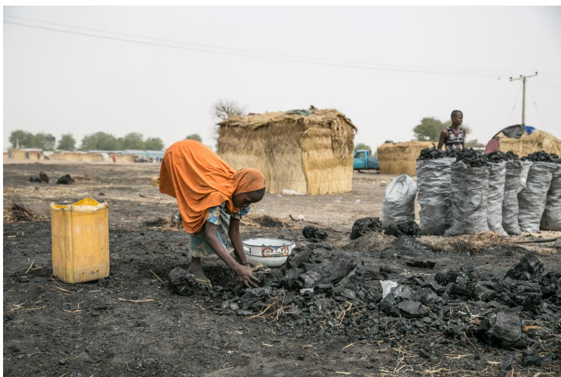
A girl picks up charcoals inside an IDP camp on 21 April 2019 in Maiduguri, Nigeria.