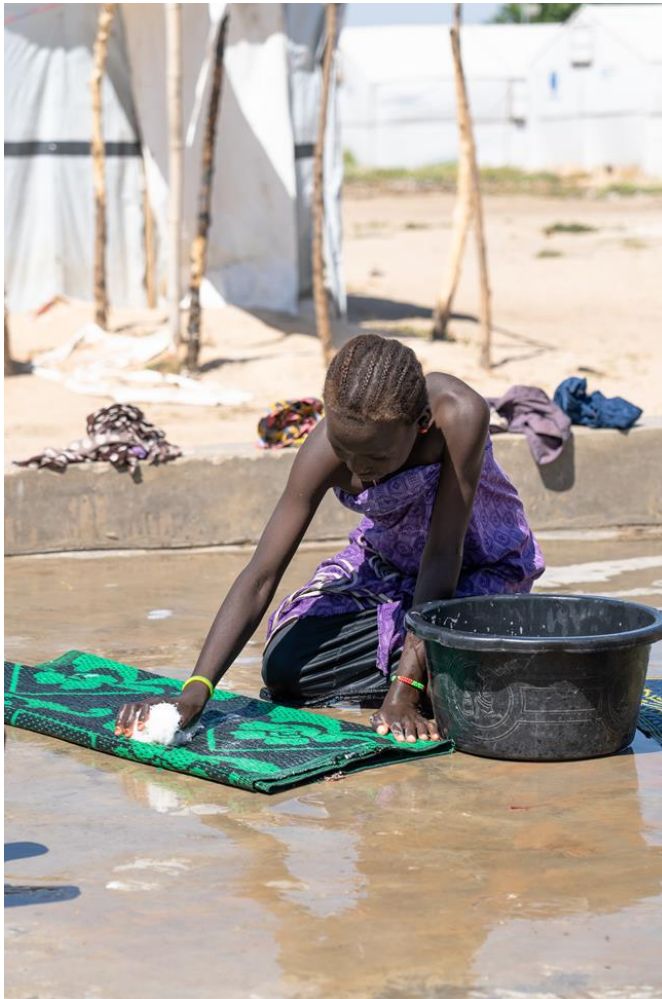
A girl washes a sleeping mat in Bakasi IDP Camp, Maiduguri, Borno State, 2019.

The school is far... From Water Board to the front of the market [near the school] is 50 naira each. For the two of them it's 100, to come back is also 100, so I give them 200 naira (US$0.51) daily for transport... What I do for work is go to the bush and get firewood; I sell it, leaving some for cooking, and out of the money [made], I pay their daily fare. Sometimes I won't even have money to pay for their transport. Those days they come back on foot. If [the school] close[s] at 1pm on days they don't have money, they get home around 3pm. If you're an adult and you're walking very fast, you may get to the camp in 45 minutes, but you know children will want to play on the road. 472