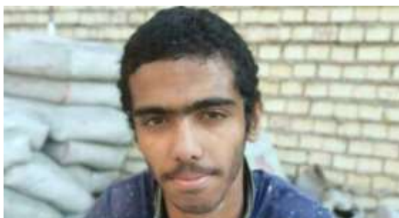
Mohsen Mohammadpour © Private