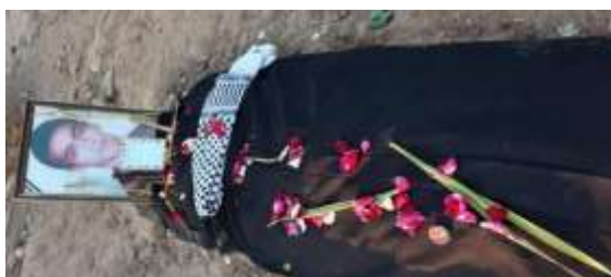
Mohsen Mohammadpour’s grave site

Mohsen Mohammadpour was killed by Iran’s security forces on 18 November 2019 during a protest in the city of Khorramshahr, Khuzestan province, according to an informed local source who had participated in the protests in Khorramshahr and was interviewed by Amnesty International.