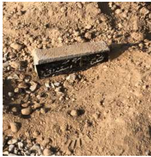
Reported grave site of Nikta Esfandani

Nikta Esfandani, a 14-year old girl from Tehran, reportedly died on 16 November 2019.