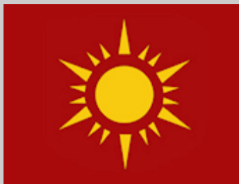
The insignia of the Myanmar Army's Northeast Command

Operationally, the Myanmar Army is comprised of two command structures: the regional commands, which oversee the Army's actions in specific geographic areas; and the combat divisions, which are moved around the country to areas of high priority. Civilians in northern Shan State implicated soldiers from the Regional Command and from different combat divisions in violations.