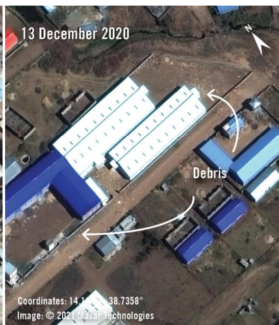
Debris consistent with looting around an unidentified building in central Axum, shown on satellite imagery from 13 December 2020. According to residents, Eritrean soldiers looted the university, private houses, hotels, hospitals, grain storage facilities, petrol stations, banks, electrical and maintenance stores, supermarkets, bakeries, jewelries, vendors' shacks (known locally as "containers"), and other shops, breaking through entrance doors with automatic weapons.

The soldiers stole luxury goods, machinery (such as generators and water pumps), vehicles (including bicycles, trucks, three-wheel vehicles, and cars, sometimes taken from their garage), as well as medication, furniture, household items, food, and drink. "They looted whatever they could get. If they got mango juice, they would drink it and then carry things on the truck," a man said. 101