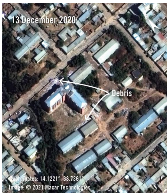
Debris consistent with looting around buildings that appear to be warehouses or industrial facilities, on the southern edges of Axum, shown on satellite imagery from 13 December 2020. Eritrean forces systematically looted the city. Residents said Eritrean soldiers stole sugar and flour from a store called Guna Trading; that they robbed May Akko, a large community store, of truckloads of sugar, cooking oil and lentils, and that they took flour and animal fodder from the Dejen Flour Factory.