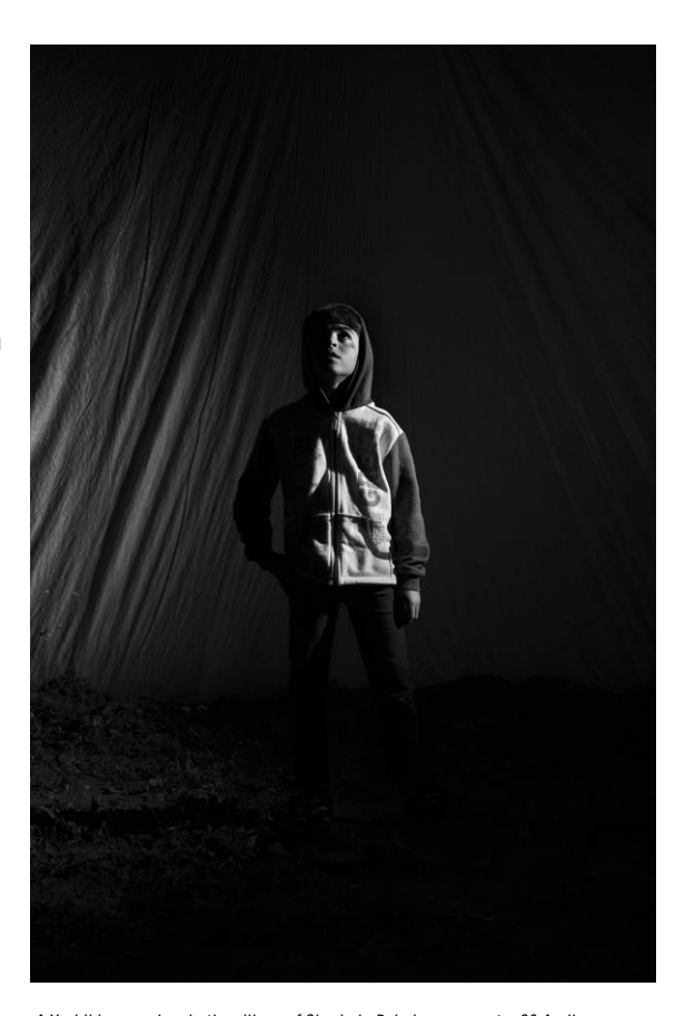
A Yezidi boy survivor in the village of Sharia in Dohuk governorate. 20 April 2019.

Humanitarian workers as well as child survivors and caregivers interviewed for this report said there were no resources of which they were aware, whether offered by local or international NGOs or by government authorities, to help them address and overcome these language barriers.