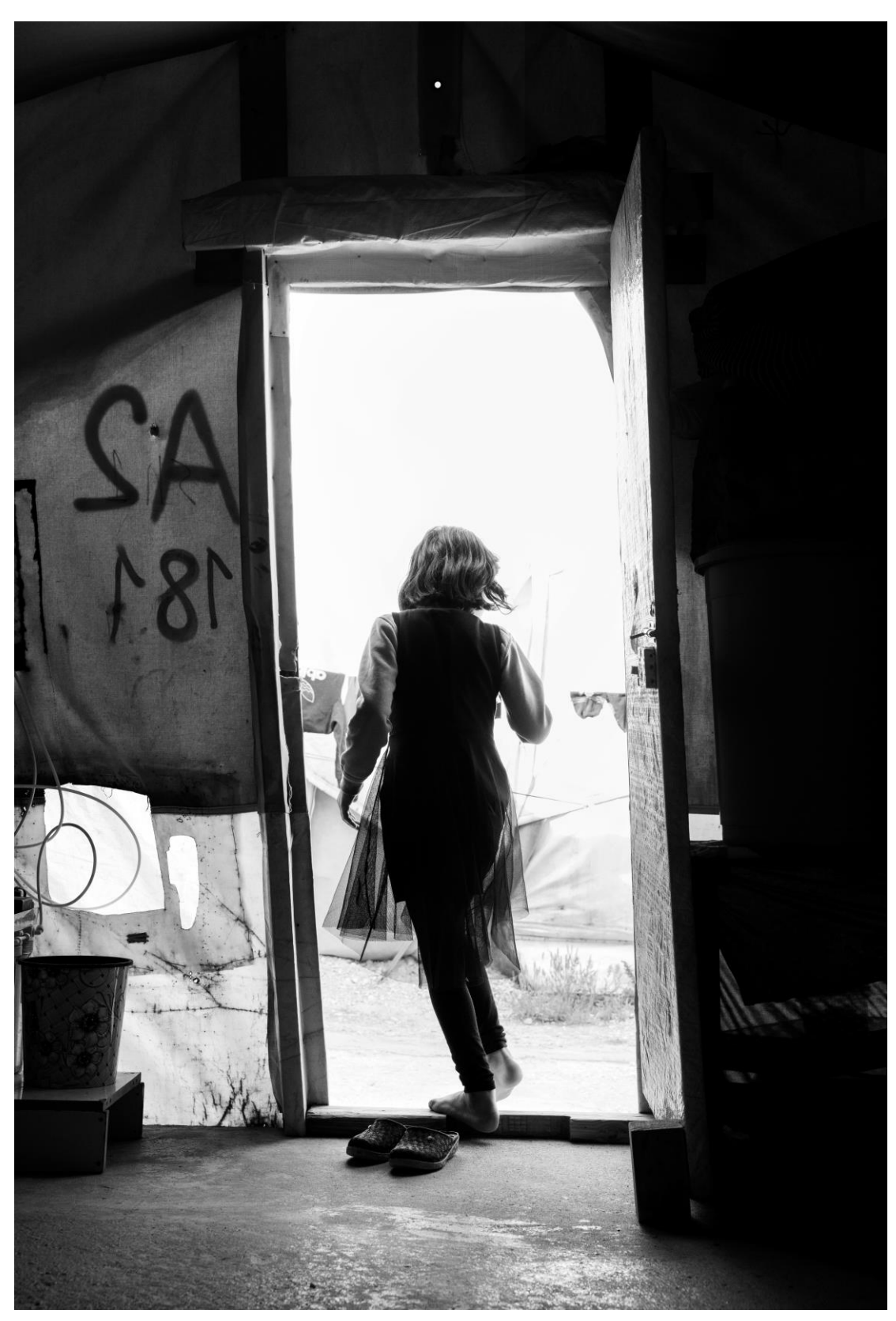
A Yezidi girl survivor at Sharia IDP Camp in Dohuk governorate. 18 April 2019.