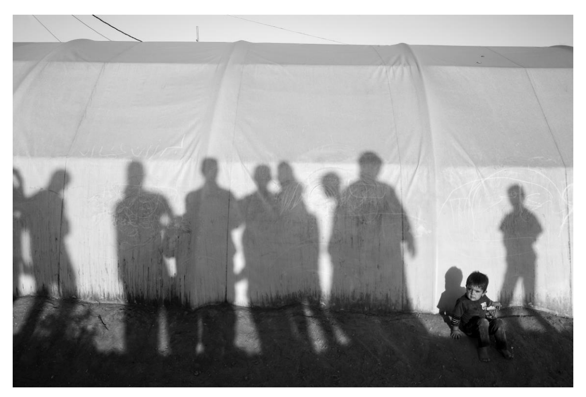
A Yezidi boy sits near a shelter in an IDP camp in Dohuk governorate. 7 August 2014.