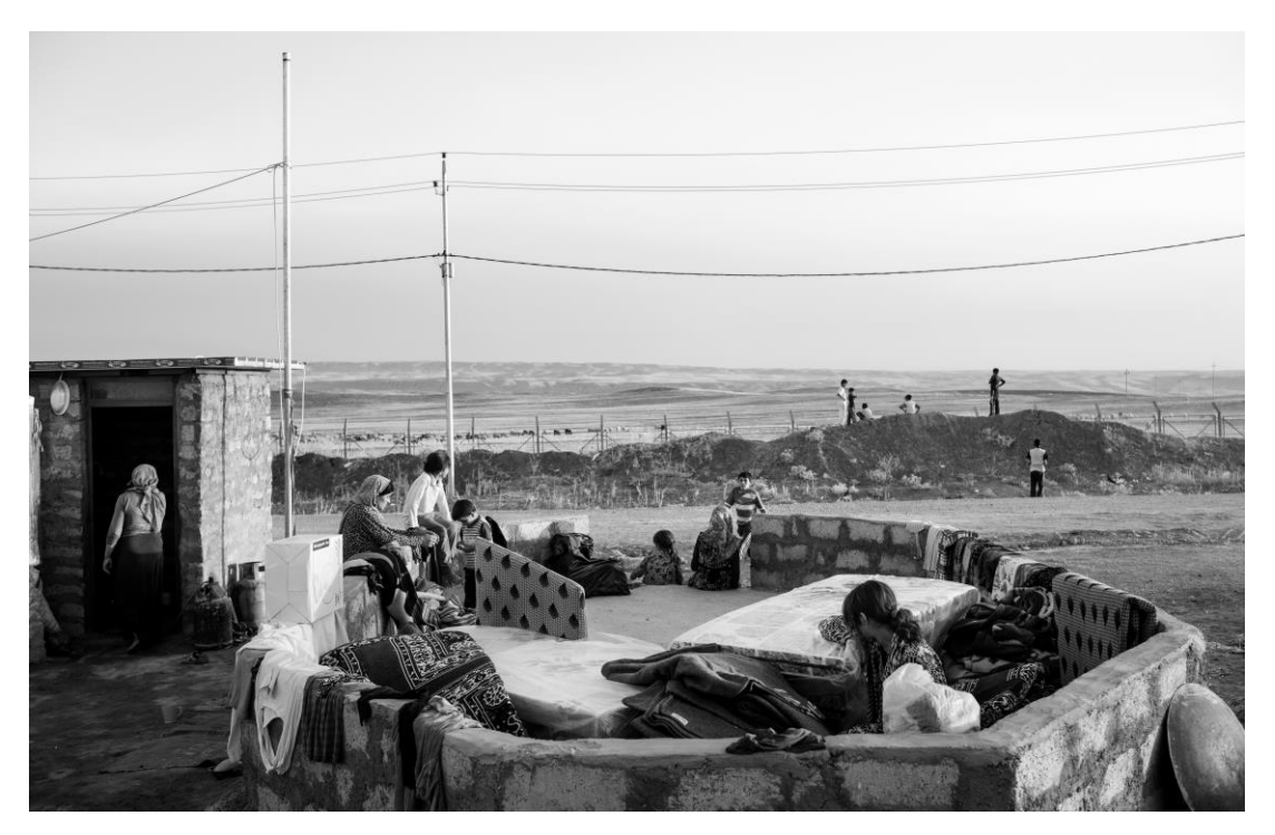
\textit{Yezidis who fled their homes in the Sinjar region take shelter at Bajid Kandal IDP camp in Dohuk governorate. \textit{7 August 2014.} \\

Other crimes committed by IS against the Yezidi community include the destruction of several important Yezidi temples and shrines and the looting and destruction of Yezidi homes. <sup>29</sup> An extensive retrospective survey has calculated that in August 2014 alone, IS killed 3,100 Yezidis and abducted 6,800 more. According to this survey, children under the age of 14 made up 33.7% of the total abductees. <sup>30</sup> According to Al-Monitor , the United Nations Investigative Team to Promote Accountability for Crimes Committed by Da'esh/Islamic State in Iraq and the Levant (UNITAD) stated at a Baghdad press conference in April 2020 that 73 mass graves of Yezidis have been found in Iraq since 2014, 13 of which have been exhumed. <sup>31</sup> The Kurdish Regional Government's Office of Kidnapped Yazidis, based in Dohuk, estimated that as of February 2020, 2,884 Yezidi adults and children remain missing. Many of these adults and children are believed to still be in IS captivity. <sup>32</sup>