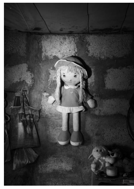
A doll on the wall where a boy child survivor lives with his uncle and aunt in Khanke IDP Camp in Dohuk governorate. 20 April 2019.