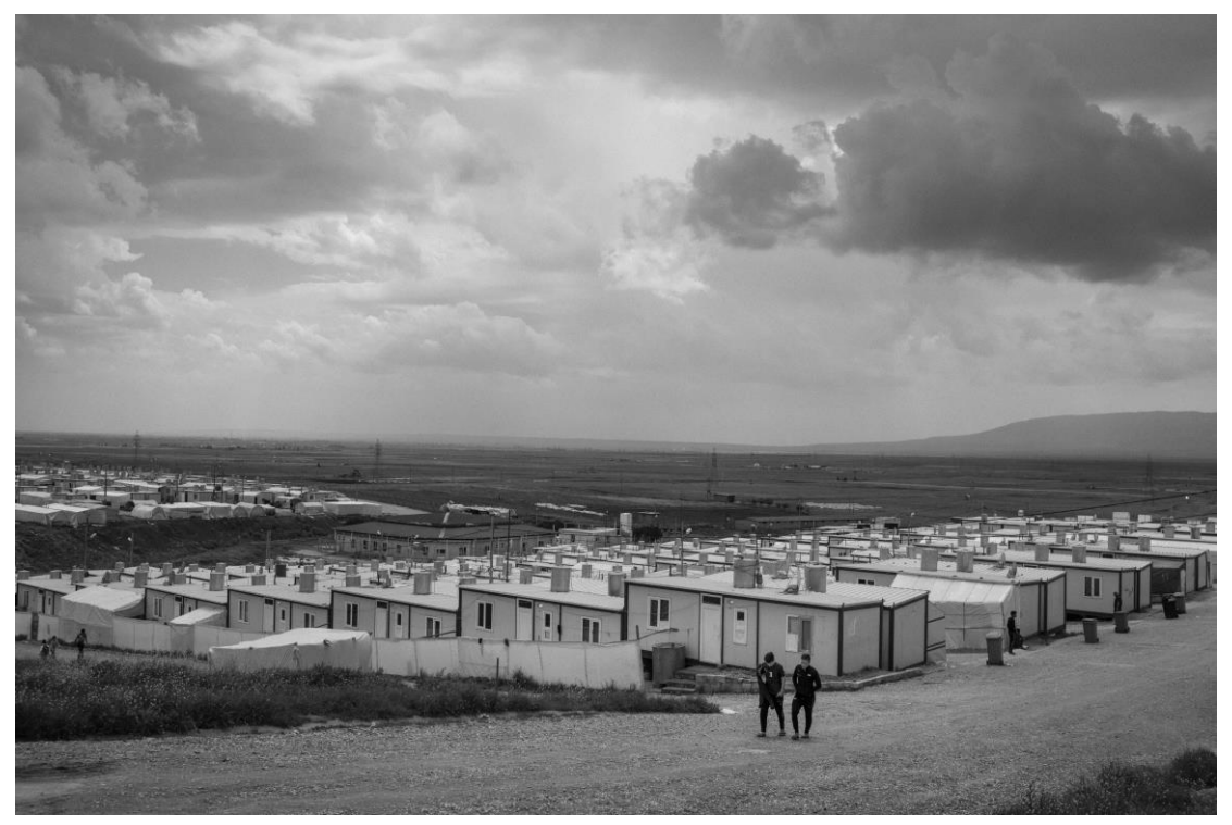
Mamrashan IDP Camp, Dohuk governorate.