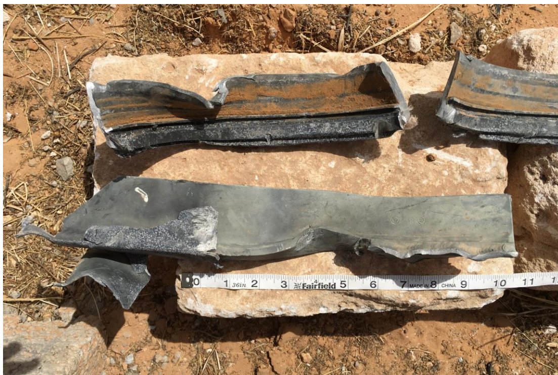
Remnants of the tail section of a FAB-500ShL "parachute" bomb that injured two women in Tarhouna.