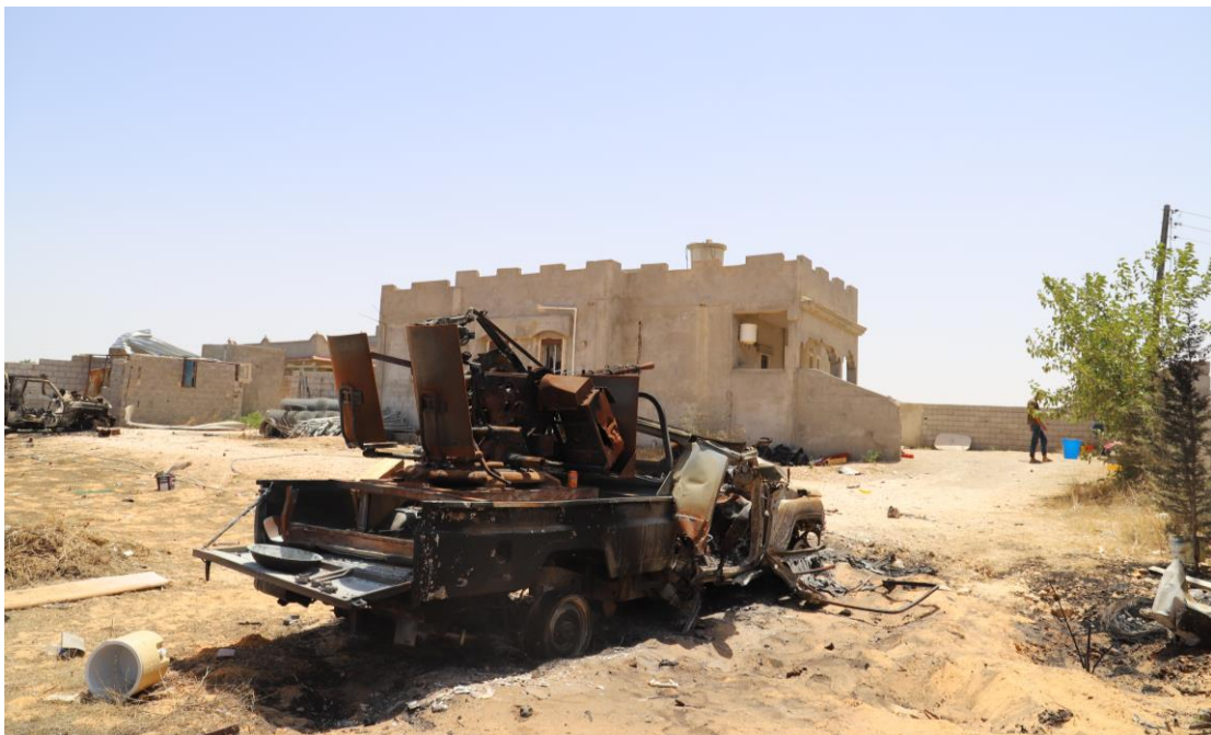
A machine gun mounted on a militia pick up truck destroyed by an LNA strike on a militia base adjacent to a field hospital.

Amnesty International also examined other LNA attacks that struck field hospitals and ambulances, but was unable to conclude whether these had been intentionally targeted and whether these attacks violated international humanitarian law. 53 For example, Amnesty International visited two other field hospitals in the Wadi al-Rabe'a area, south of Tripoli, one in the same compound as a military base which had been attacked by at least two Blue Arrow 7 missiles, and another which was located in the same building as a military command position, which had not been subject to attack. At a third location, in the al-Swani area south of Tripoli, three medics were injured in a 6 June 2019 air strike; 54 fragments recovered at the scene by Amnesty International confirmed that the weapon was a French SAMP 250kg bomb. However, military vehicles with mounted heavy machine guns were observed in satellite imagery near the site prior to the strike. At least two strikes on ambulances examined by Amnesty International, one in the Wadi al-Rabea area and one east of the Airport Highway, are likewise ambiguous, in that fighters in military vehicles were being chased by LNA forces and were very close to the ambulances when these were struck.