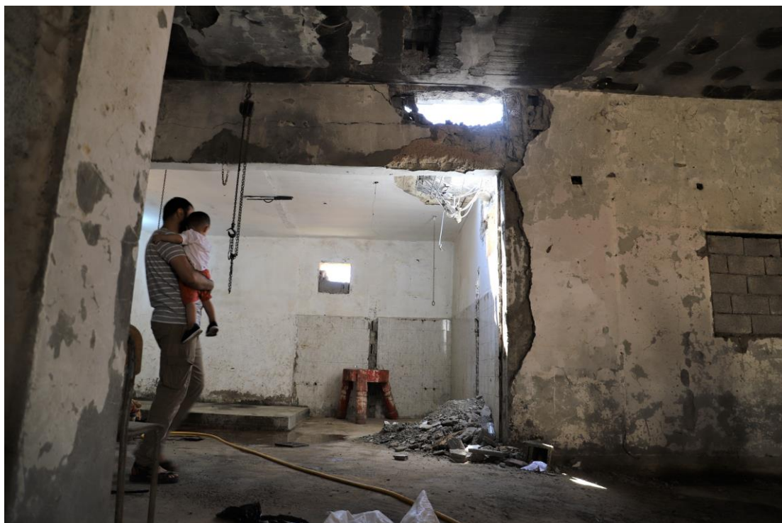
A house in the Souq al-Joumaa neighbourhood of Tripoli damaged by an artillery strike which injured three civilians on 11 August 2019.