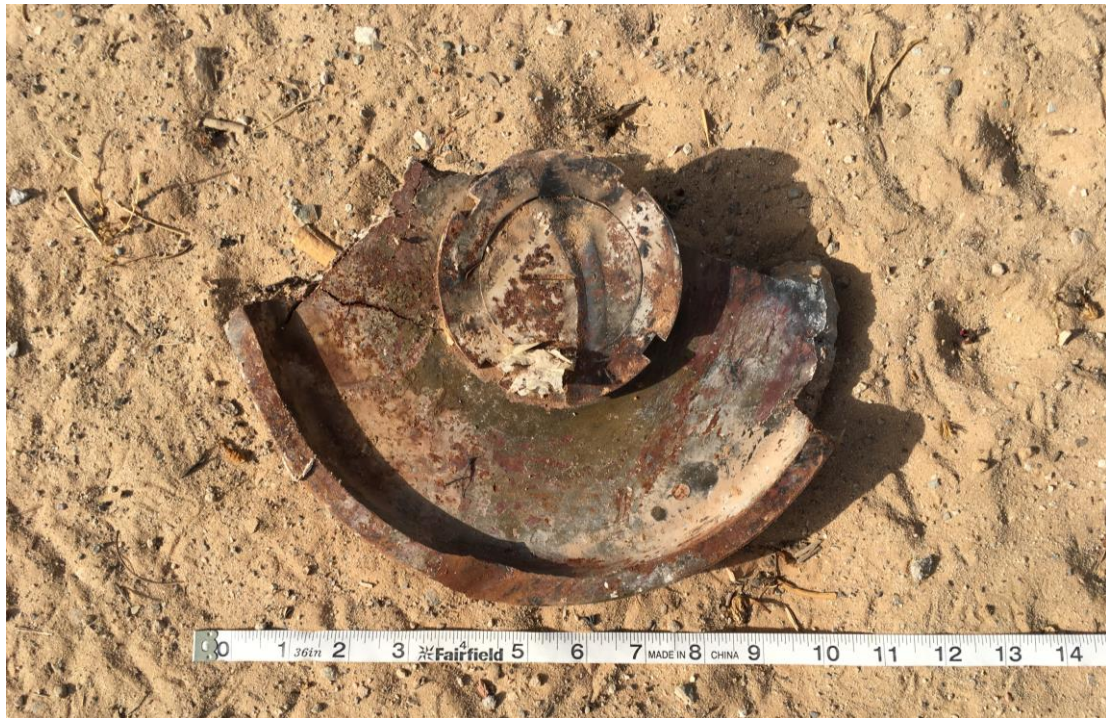
The intact baseplate of a unguided French 250kg SAMP aircraft bomb, recovered by Amnesty International investigators from the crater left by the strike on the home of the Qreira family.