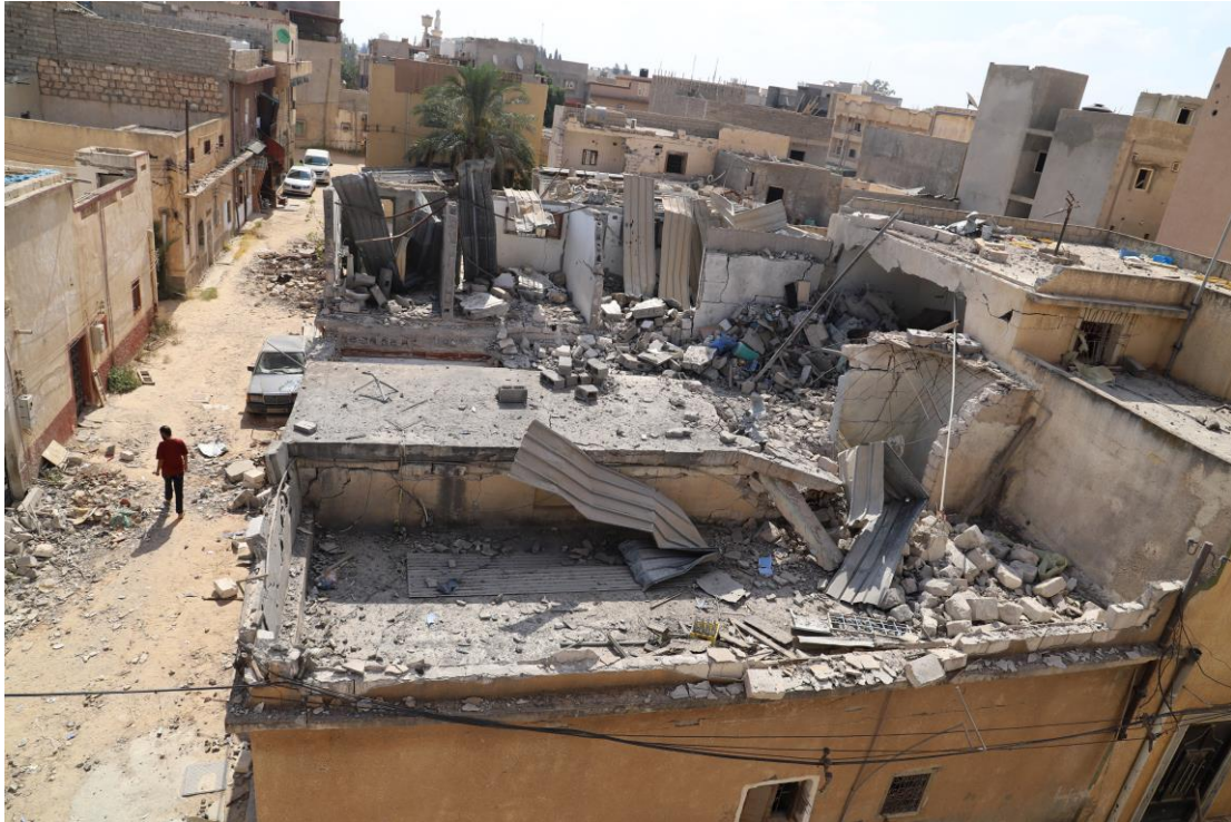
Houses in Qasr Bin Ghashir destroyed by GNA airstrikes on 23 June 2019.

In addition to the current fighting around Tripoli, between the GNA and LNA and their affiliated militias, clashes for control of territory and resources continue in the east and south of the country, among Tebu, Tuareg and Arab armed groups. 7