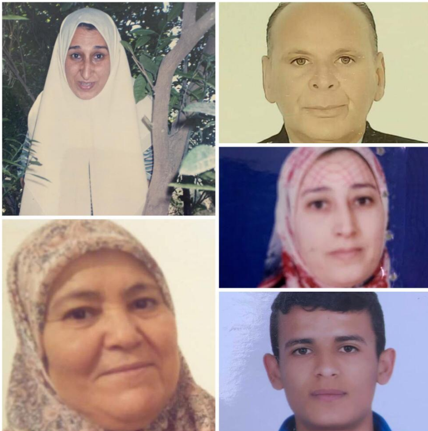
Some of the victims of the strike on the Abu Salim neighbourhood.

The rockets used in this strike on the Abu Salim neighbourhood are notoriously inaccurate. They cannot be aimed precisely at specific targets and should therefore never be used in populated residential areas. Those who launched these strikes would have known that the likelihood of harming civilians was very high. International humanitarian law prohibits indiscriminate attacks (attacks which are not directed at a specific military objective), as well as attacks which employ a method or means of combat which cannot be directed at a specific military objective. 25 Launching an indiscriminate attack resulting in death or injury to civilians constitutes a war crime. 26