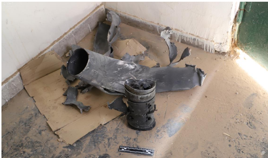
Remain of a Grad rocket fired by the LNA into a residential neighbourhood of Tripoli near Mitiga airport.

Fragments recovered at the scene by Amnesty International investigators confirm that the weapon was a 122mm 9M22U “Grad” rocket.