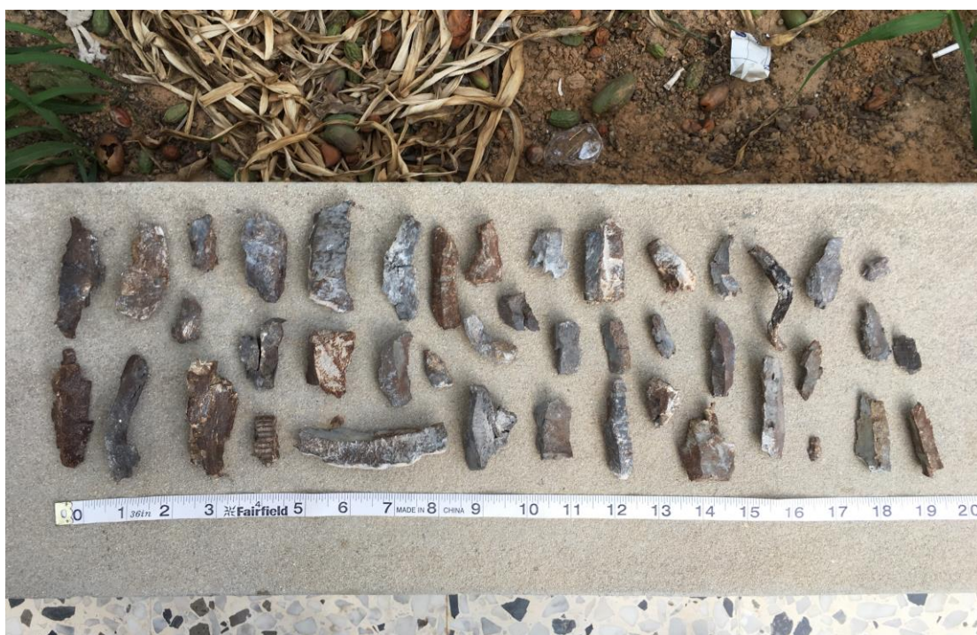
Fragments of an OF-412 100mm artillery projectile, recovered by Amnesty International investigators at the scene of the strike that killed Anwar Mabrouk Mlitan, a 50-year-old carpenter father of six, on the evening of 29 July 2019.