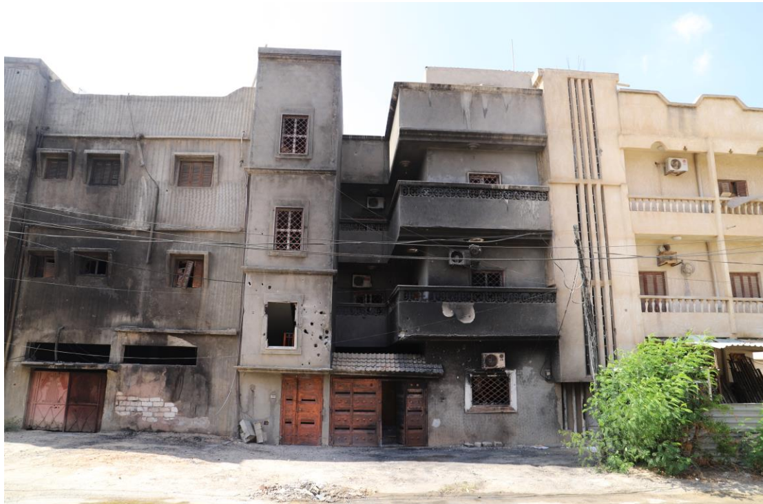
A building in Qasr Bin Ghashir damaged by a GNA artillery strike which killed at least five civilians and injured more than a dozen residents and bystanders in and around the building on 14 May 2019.

“I was at home and my brother was standing outside on the street. The strike was massive; it sent a vehicle flying on top of another vehicle and for a moment everything was black. I rushed outside and there were many neighbours dead and injured on the ground; there were severed body parts. It was a shocking sight. Then we found my brother; he had injuries everywhere; he died. I couldn’t believe it”. 27