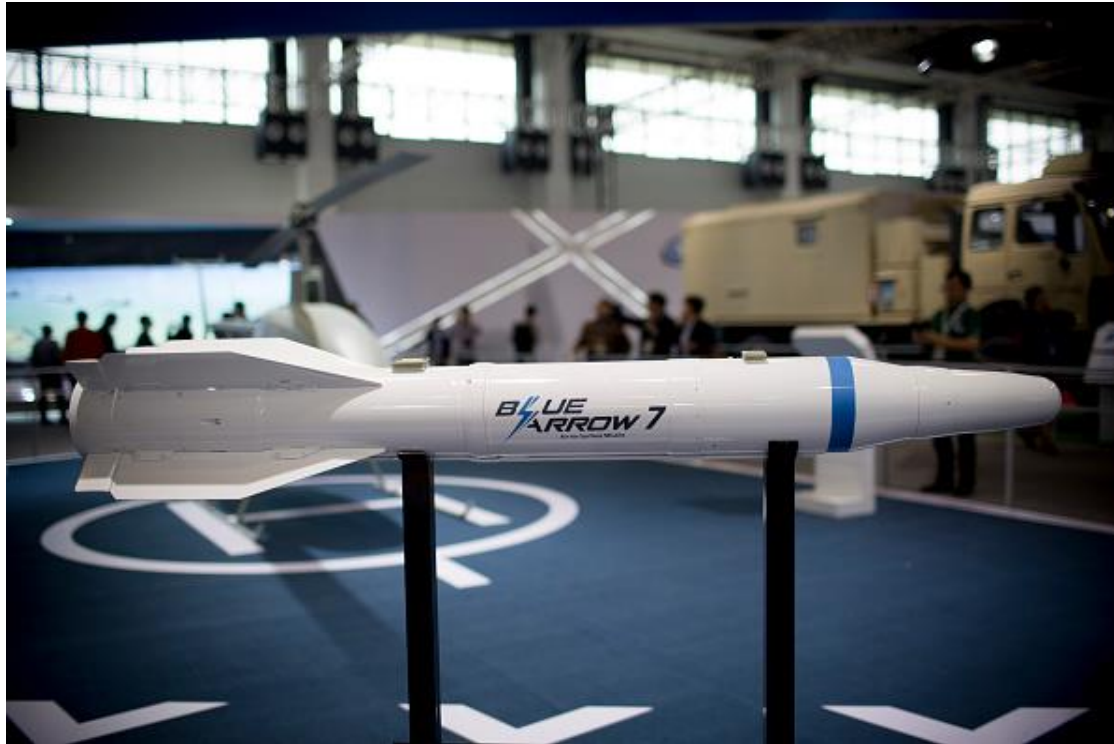
A China North Industries Group Corp. (Norinco) Blue Arrow 7 air-to-surface missile stands on display during the China International Aviation & Aerospace Exhibition in Zhuhai, Guangdong province, China, on Wednesday, Nov. 12, 2014.